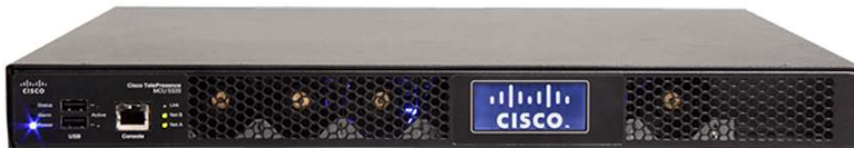
Figure 1. Cisco TelePresence MCU 5300 Series

Cisco TelePresence MCU is WebEx enabled, allowing customers to enjoy fully integrated, scalable conference involving callers from WebEx clients and telepresence endpoints.